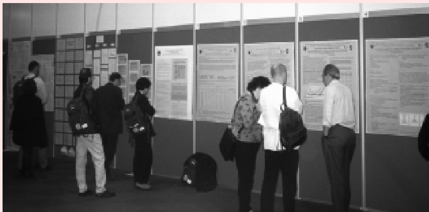
Discussions at the posters were an important part of sharing and exchanging views and experiences

In all, the symposium and its combination of scientific and clinical presentations very much emphasised the importance of a constant and critical exchange between researchers and clinicians of different specialisation to find the best possible and broadly acceptable way to treat, delay or even prevent mental illnesses that are of so much burden for the person affected, their families and society as psychoses.